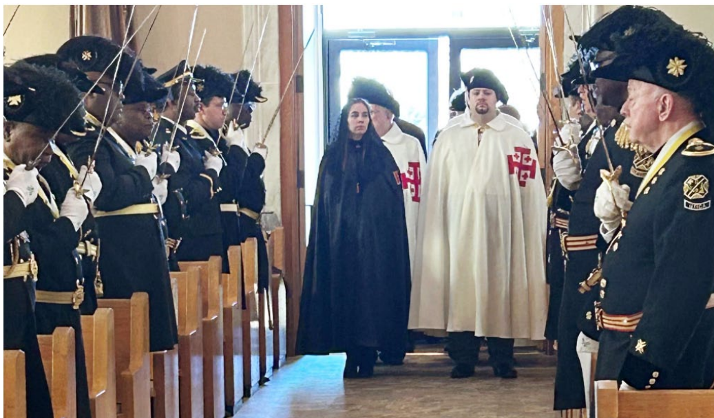
The procession and honor guard at the beginning of The Mass of Christian Burial