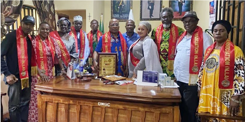
Grand President being decorated by Non Indigenes Association