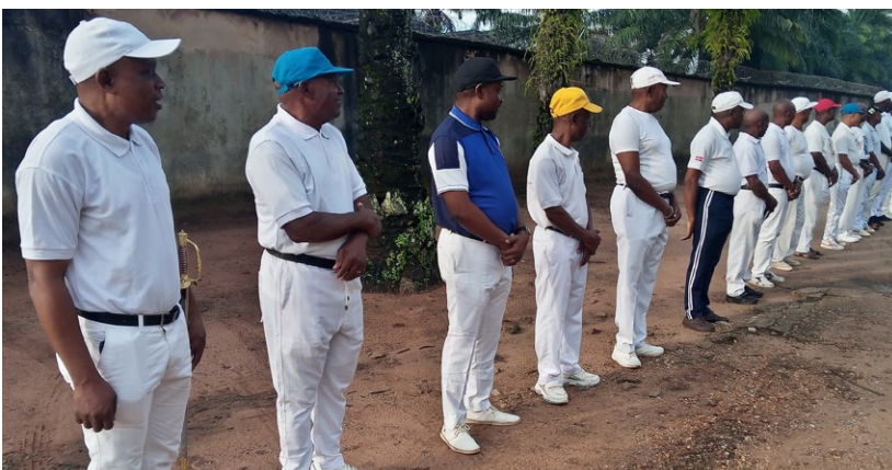
Owerri military elements in a military training