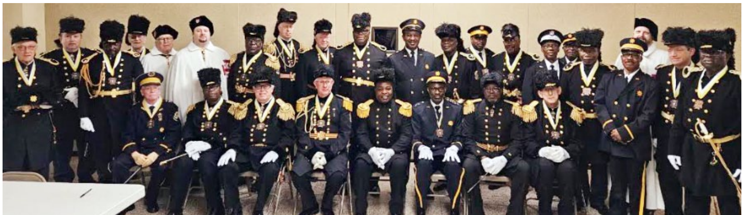
Dozens of Knights from the NY Grand, and beyond, gathered for the wake and funeral