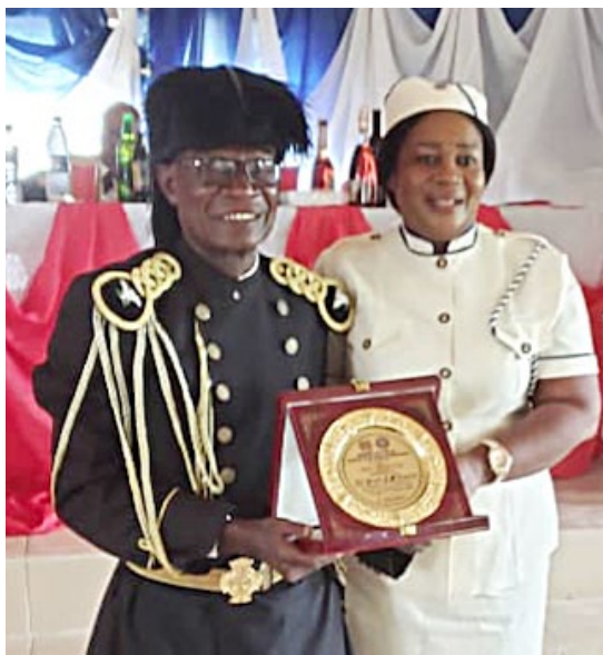
Grand Secretary showing his award by his Commandery