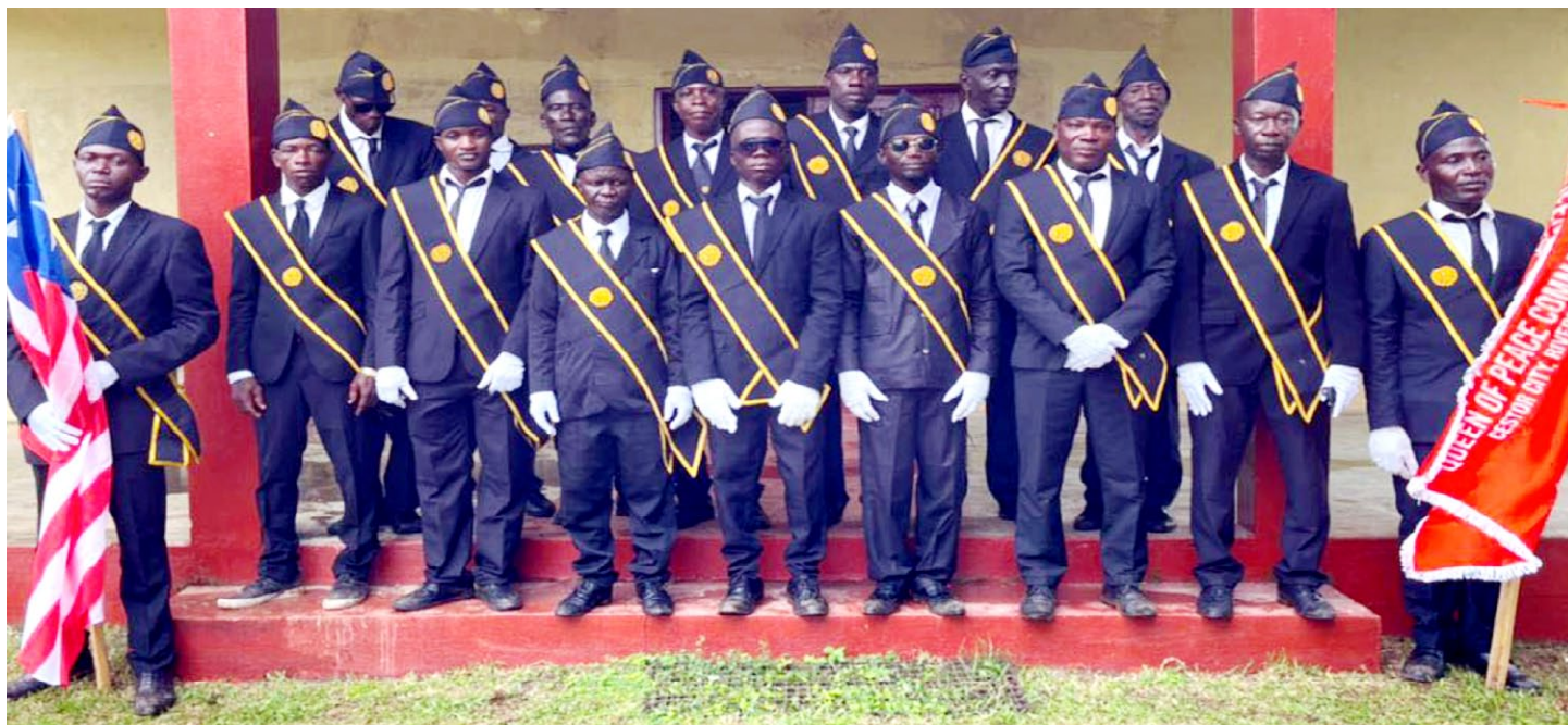
Brothers of Queen of Peace Commandery # 993 posted for photo after inauguration of new Commandery on July 9, 2023.

In July 2023, the Monrovia Grand Commandery (MGC) conducted two exercises to increase its numerical strength and to broaden the knowledge of brothers in the workings of the Order.