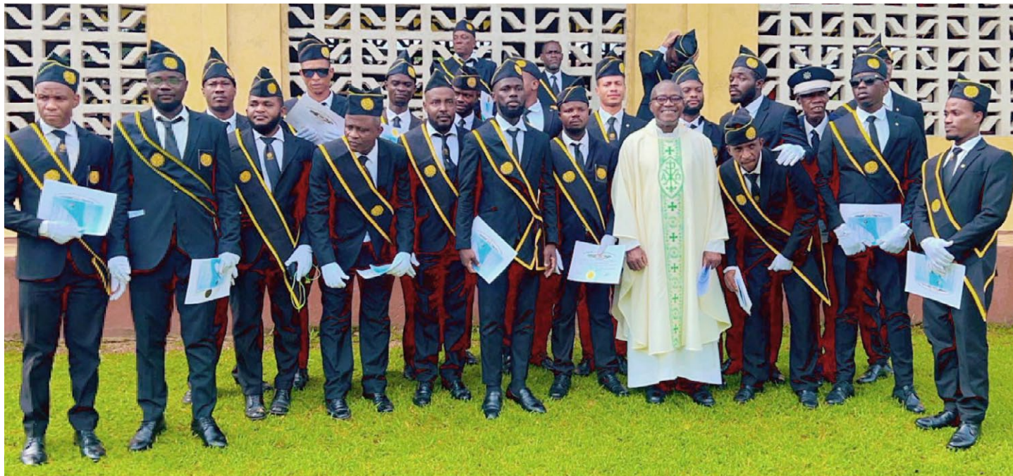
Brothers who received the 2nd & 3rd degrees on July 29,2023