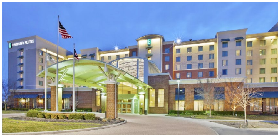
Embassy Suites Hotel