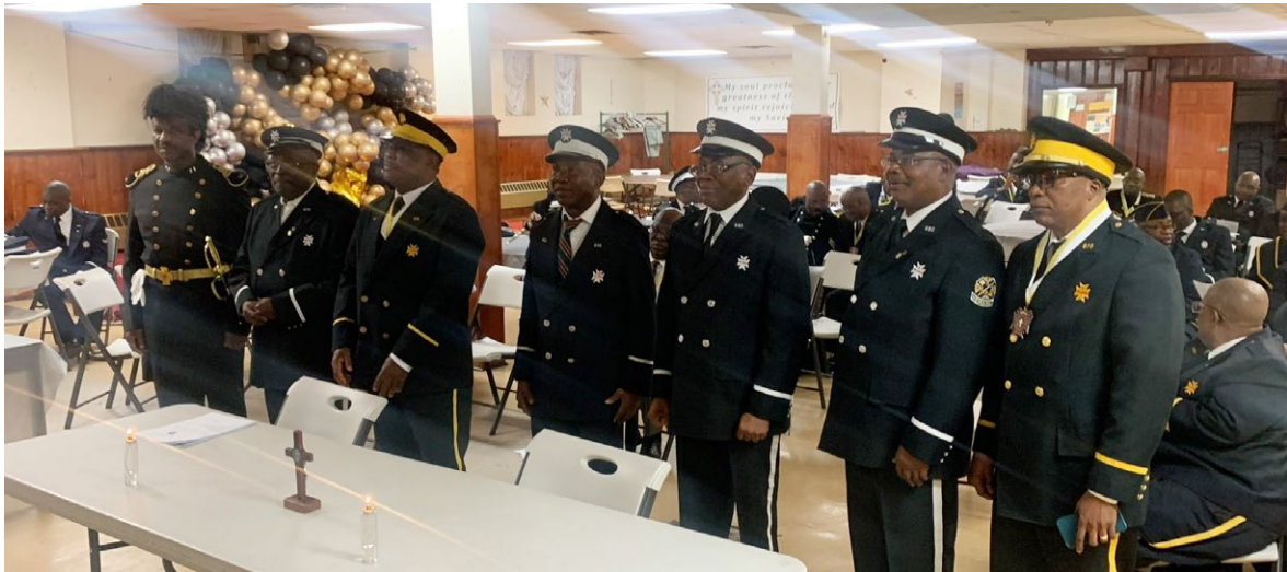
Newly elected officers