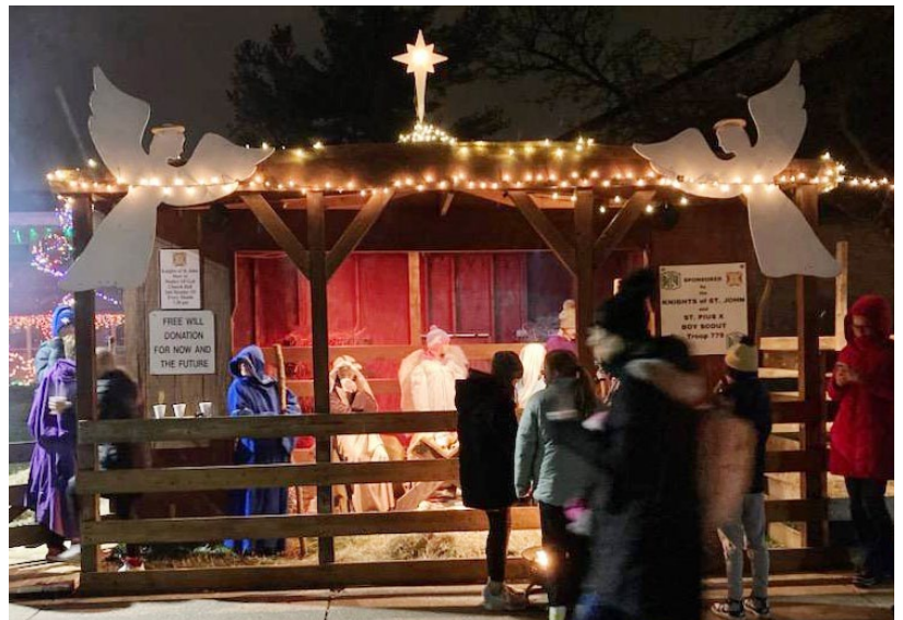
Commandery #94's live Christmas creche