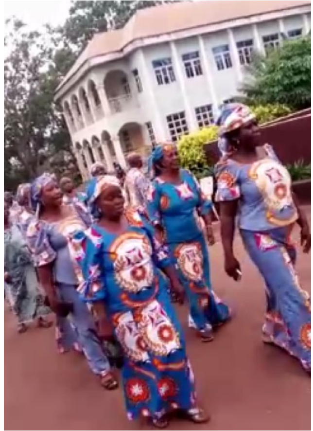
Knights and Ladies of Nsukka Grand Commandery Going for Stations of the Cross