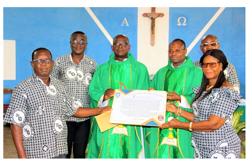
Presentation of Citation to the Knights of St John International and Ladies Auxiliary by St Victor's Major Seminary