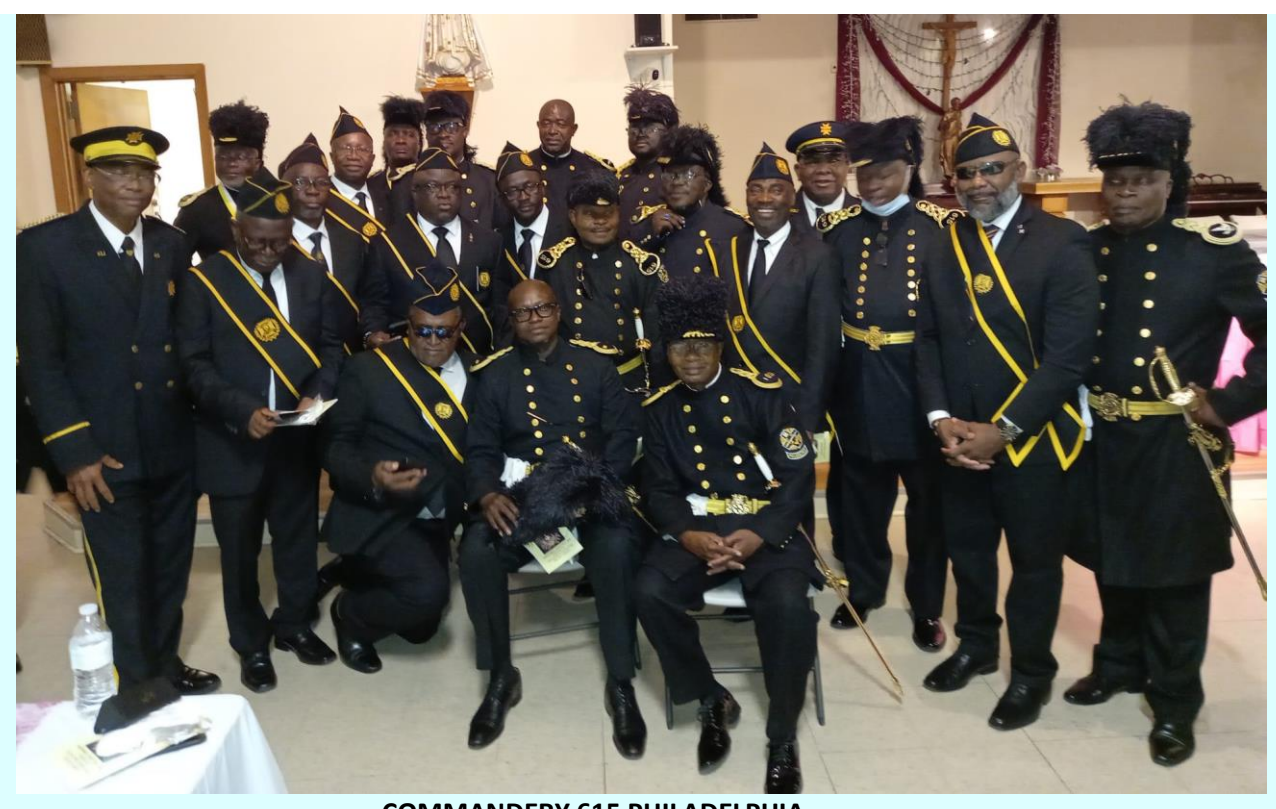
COMMANDERY 615 PHILADELPHIA