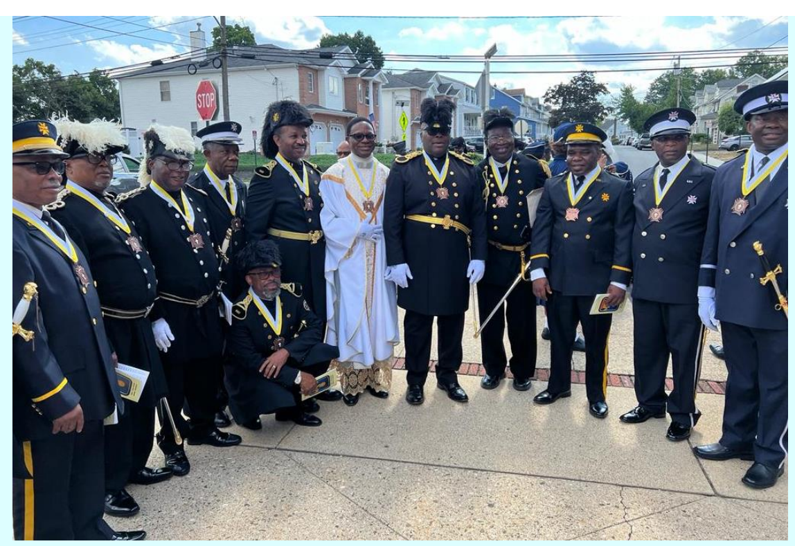
COMMANDERY 680 BLESSED SACRAMENT NJ