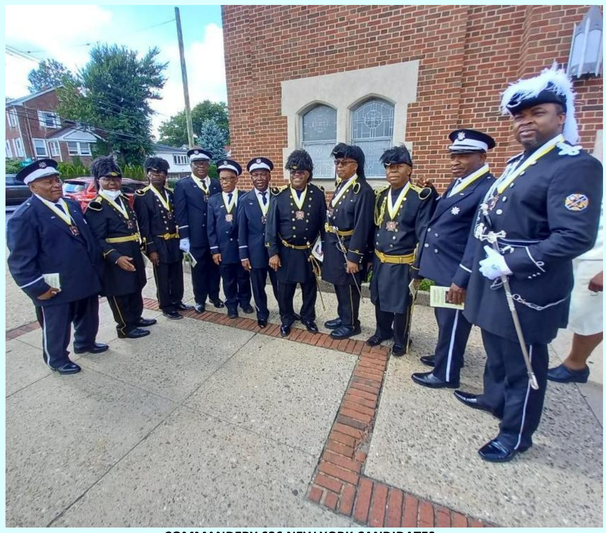
COMMANDERY 626 NEW YORK CANDIDATES