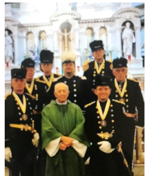
Commandery #41 still serving

A special Mass in celebration was held on Saturday, October 30th with a small reception at their clubhouse.