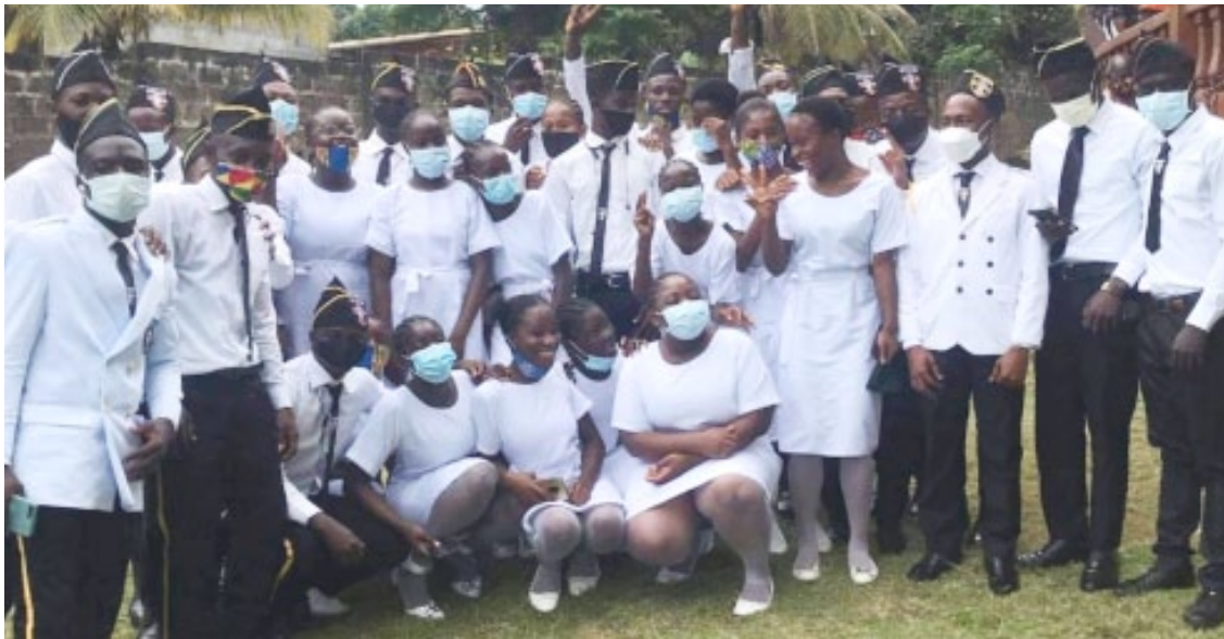
Cadets and Juniors of Liberia Commandery #607

health for this quarter. There is no report of any deaths or severe sicknesses in the Cadets and Juniors families. We thank the Almighty God for guiding and protecting us throughout this pandemic season.