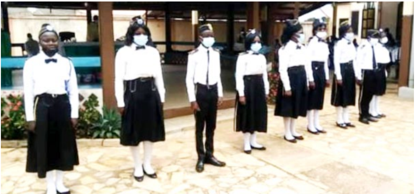
The new mixed national officers (2021 - 2023)