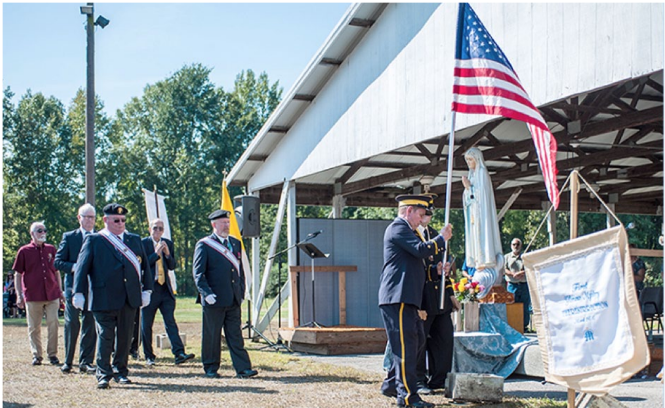
A member of the Knights of St. John carried the flag at the start of the 70th Annual Living Rosary Oct. 10 on the grounds of St. Teresa of Calcutta Church in Fairdale, Ky.

This article was published with the permission of The Record, the newspaper that serves the Catholic community in the Archdiocese of Louisville, Kentucky.