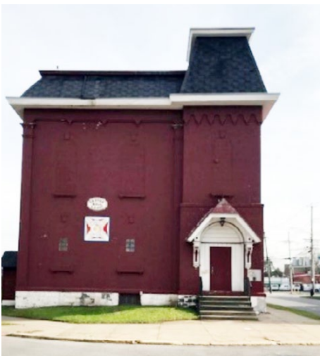
Historic Utica Commandery

In 1883, a resolution was passed to affiliate with the Knights of St. John and that spring they sent delegates to the Supreme Convention of the Knights of St. John, being held in Rochester, NY.