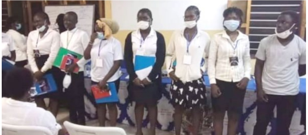
Togo Cadets and Juniors after election

The National Council of Cadets and Juniors held an election of a new mixed National Office with a Junior elected as the President. We congratulate the new President and wish her a good tenure of office.