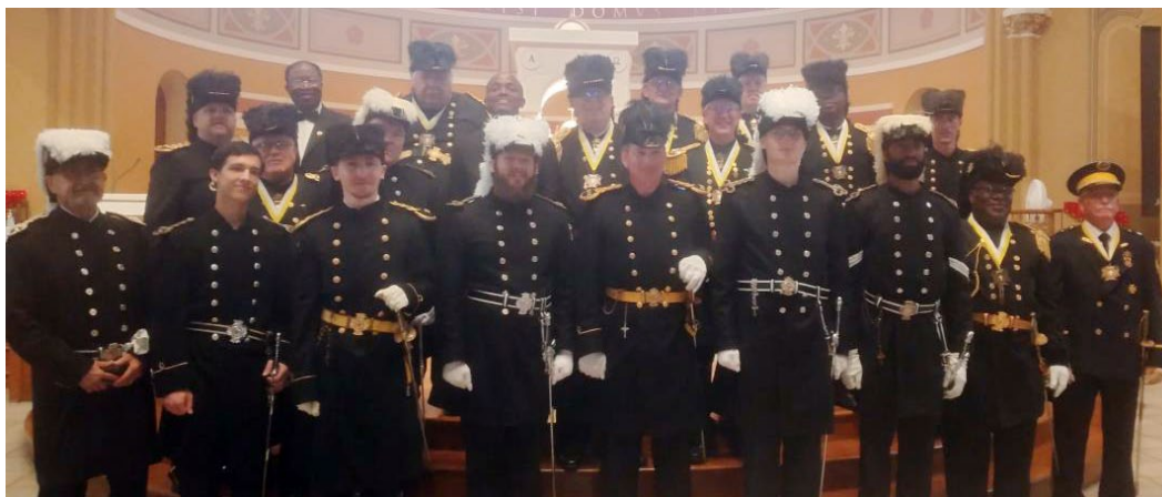
Swearing in of cabinet members and military officers of Commandery #973