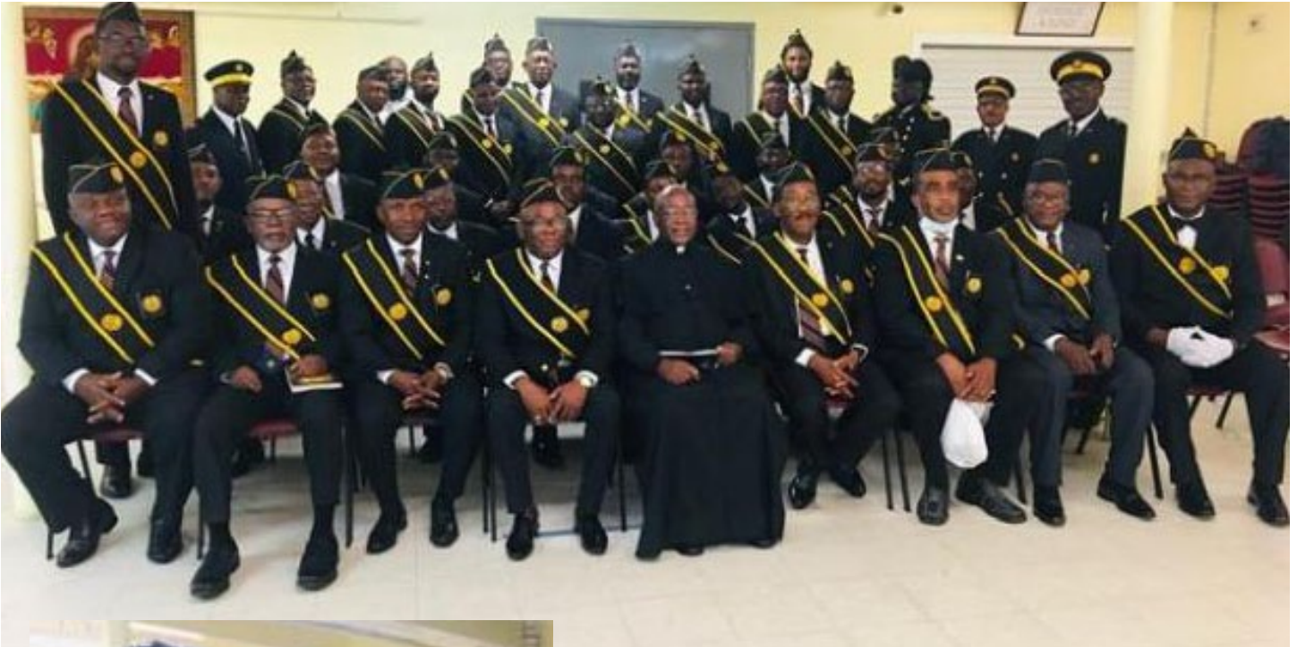
2nd and 3rd degree recipients