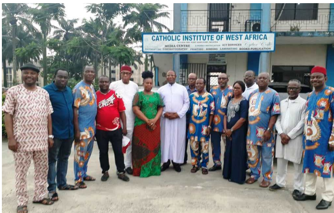
Diploma in Theology Students with the Head of Department (CIWA)