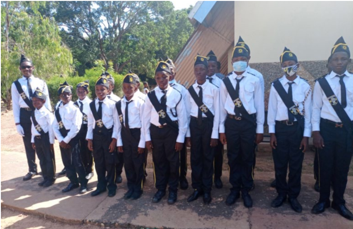
A group photograph of the St. Francis Xavier Cadets after the out-dooring Mass.