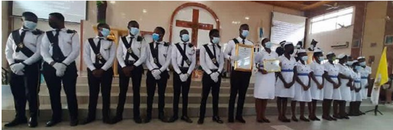
Officers of St. Joseph Cadet Commandery #836 and Our Lady of Holy Rosary #304 of Kumasi Grand Commandery.