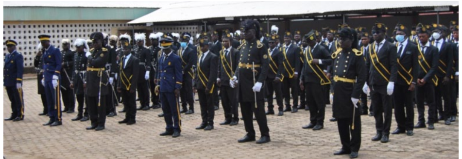
A cross section of 2nd & 3rd Degrees Brothers in a parade before the exemplification at the St. Andrew Cathedral, Wa

Two new Cadets Commanderies were inaugurated in the Wa Grand Commandery in October, namely: St. Francis Xavier and St. Paul Cadets Commanderies located in Wa and Fielmuo, respectively.