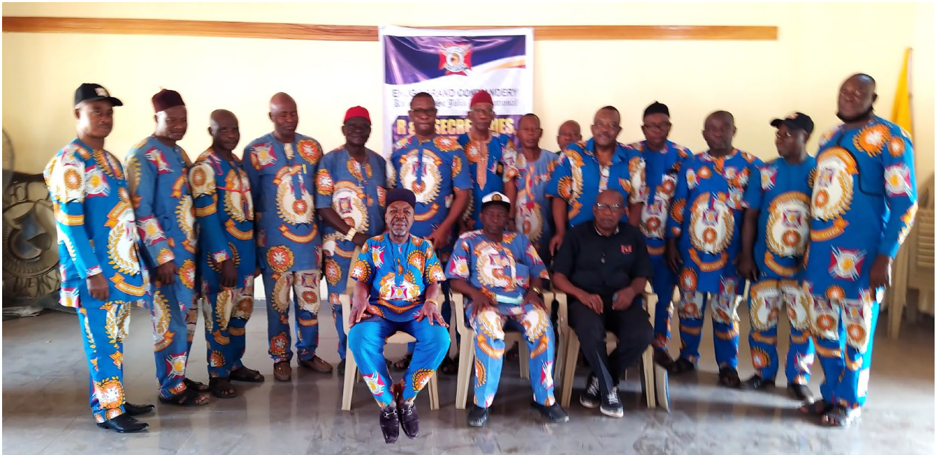
Brig Gen Obu iGroup Photograph with participants