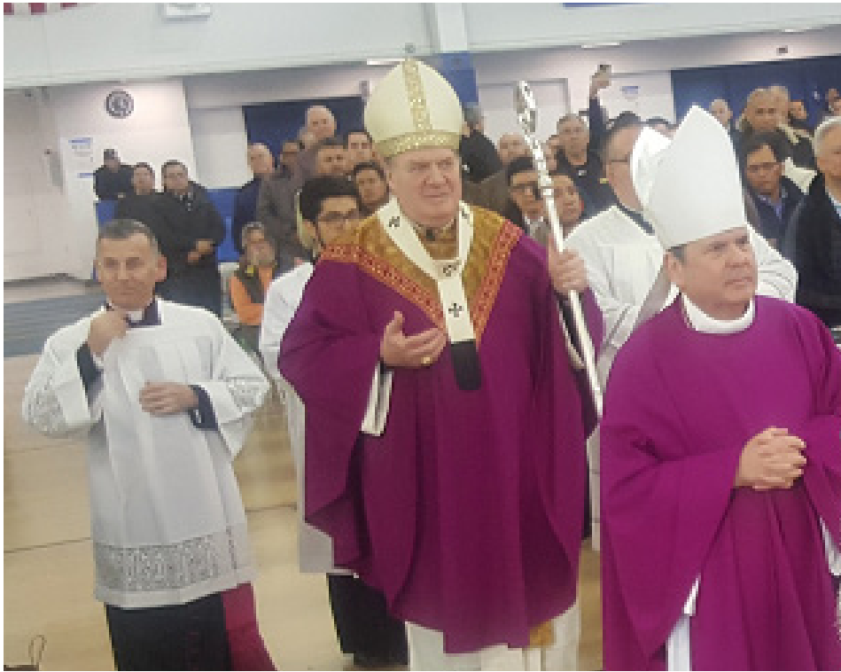
Cardinal Joseph W. Tobin made a grand entrance into the men's conference.