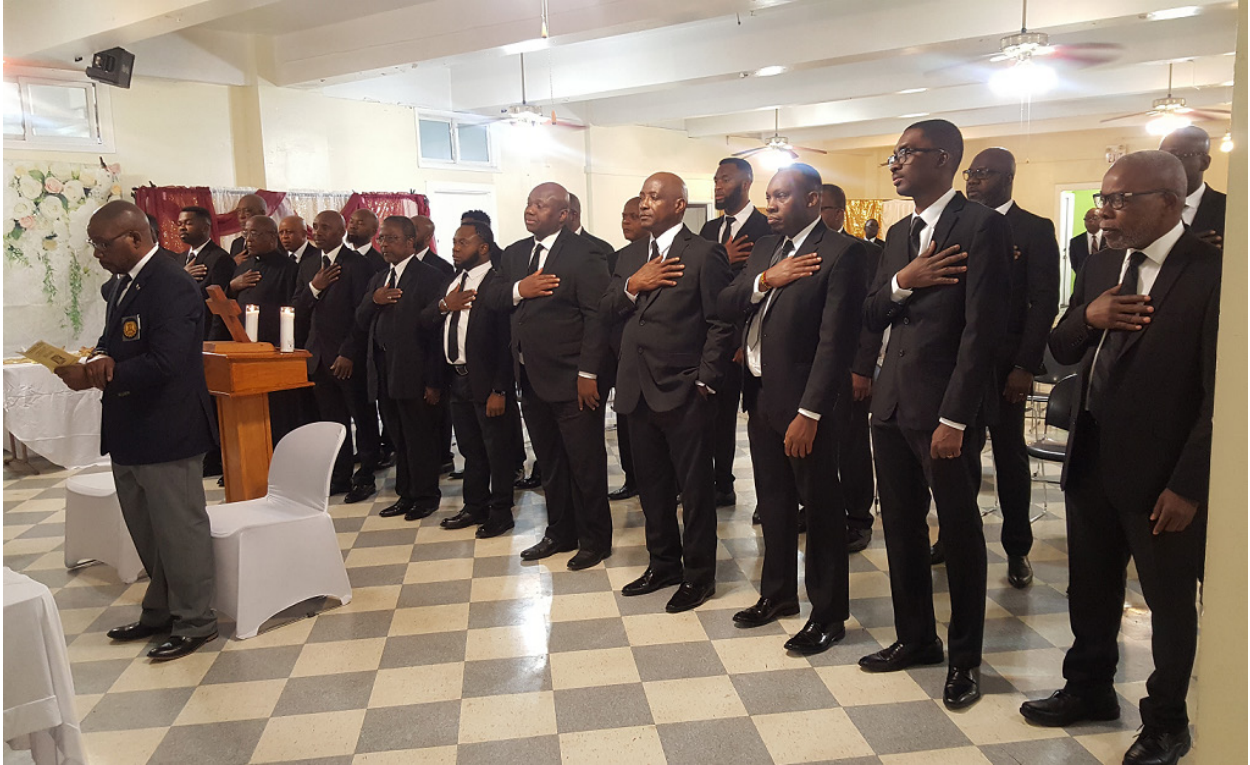
Inductees of Transfiguration Commandry take the oath.