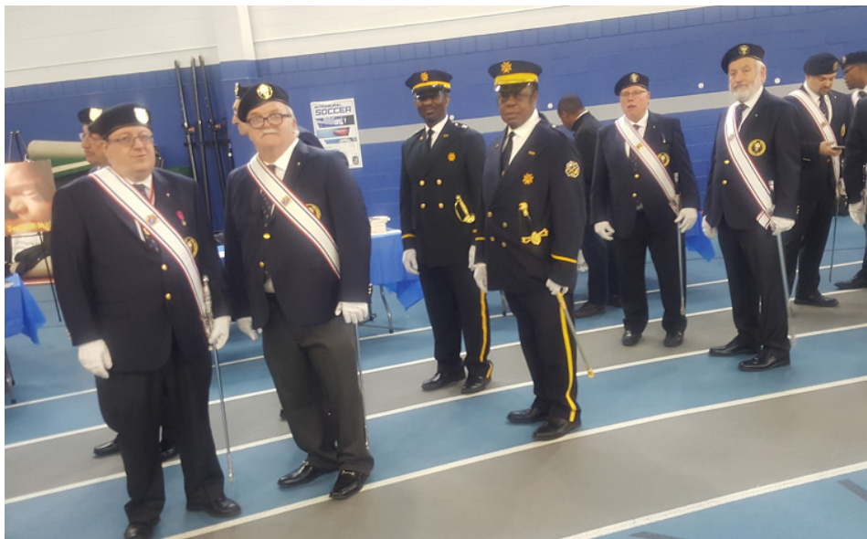
Knights of St. John and Knights of Columbus served as the honor guard for the conference.