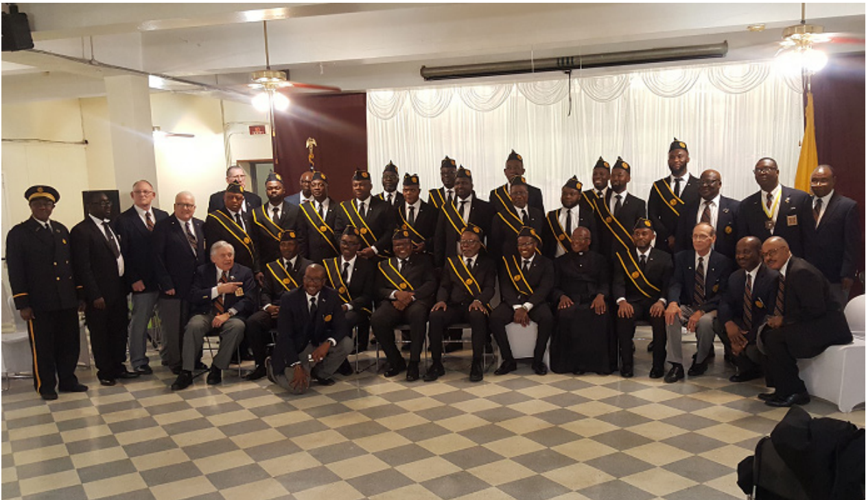
Inductees with the Supreme and Grand officers