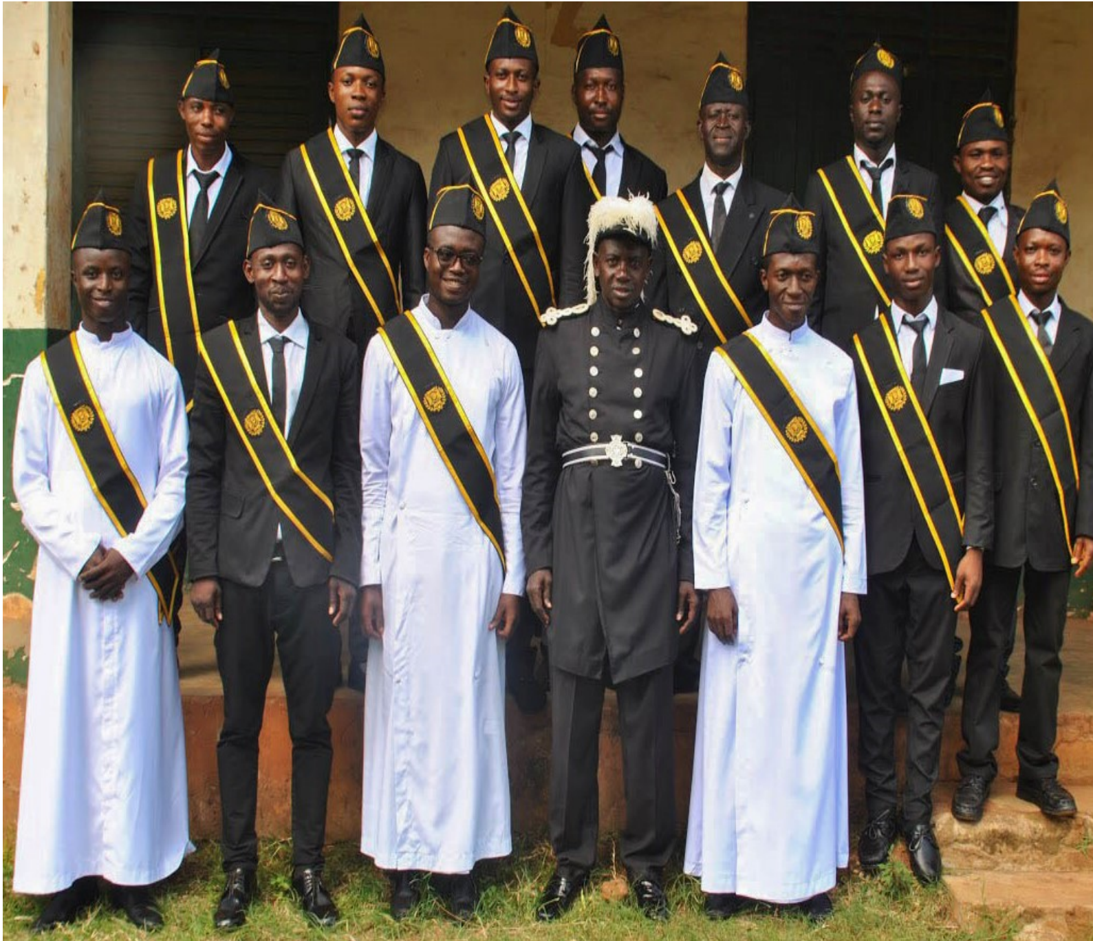
Fourteen members were initiated into St. Paul Commandery #416, including six seminarians.