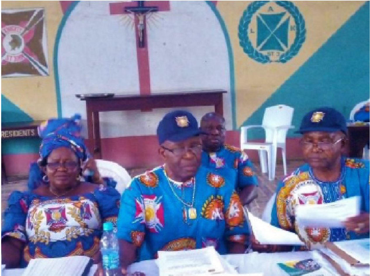
Owerri Grand president presenting the 2019 kola.