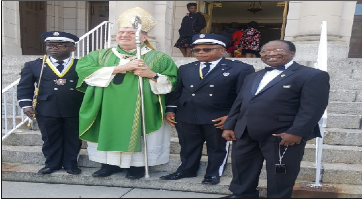
Cardinal Tobin was honored by Commandery 680.