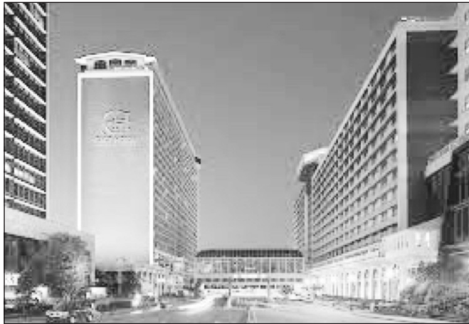
Galt House Hotel