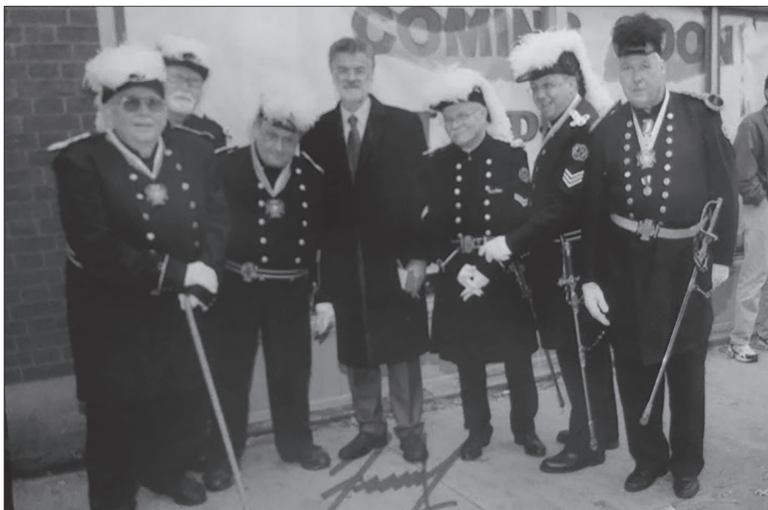
Knights pictured with Cleveland's mayor Frank Jackson prior to the Columbus Day Parade.