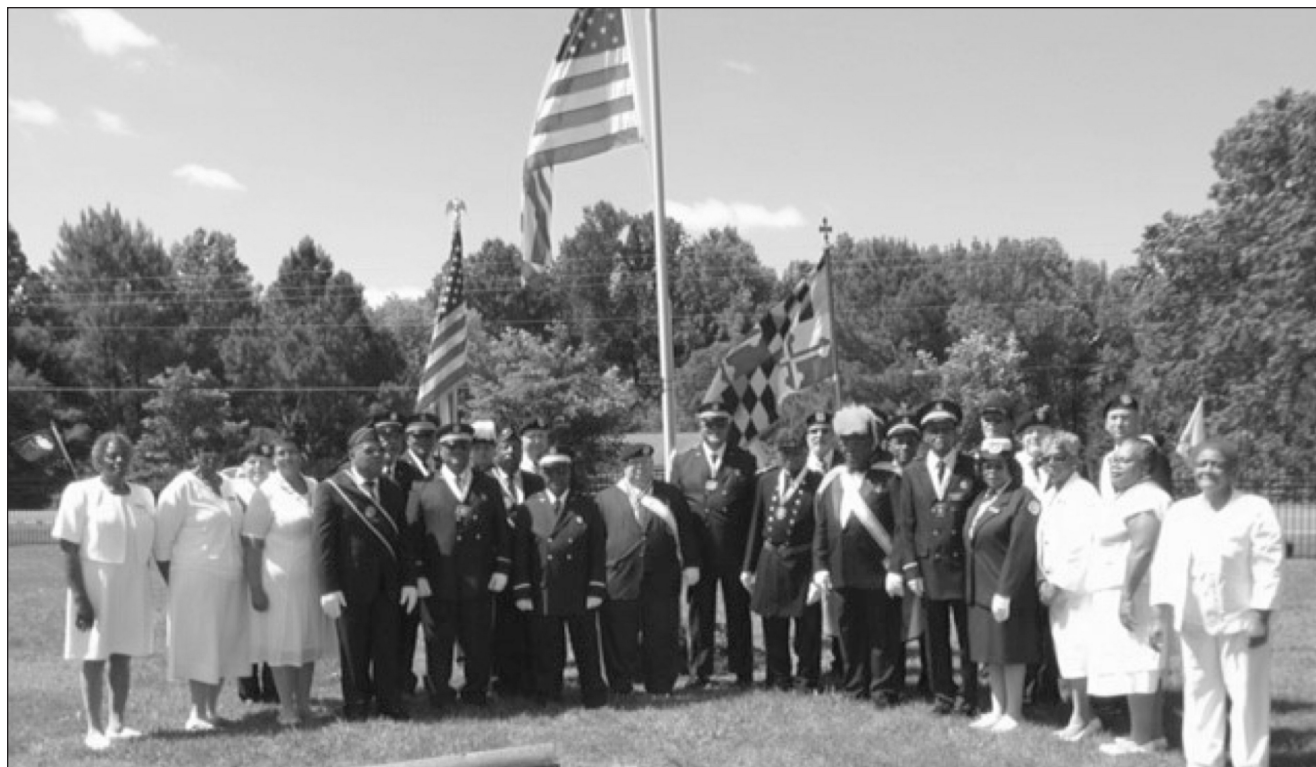
Queen of Peace Memorial Day Mass