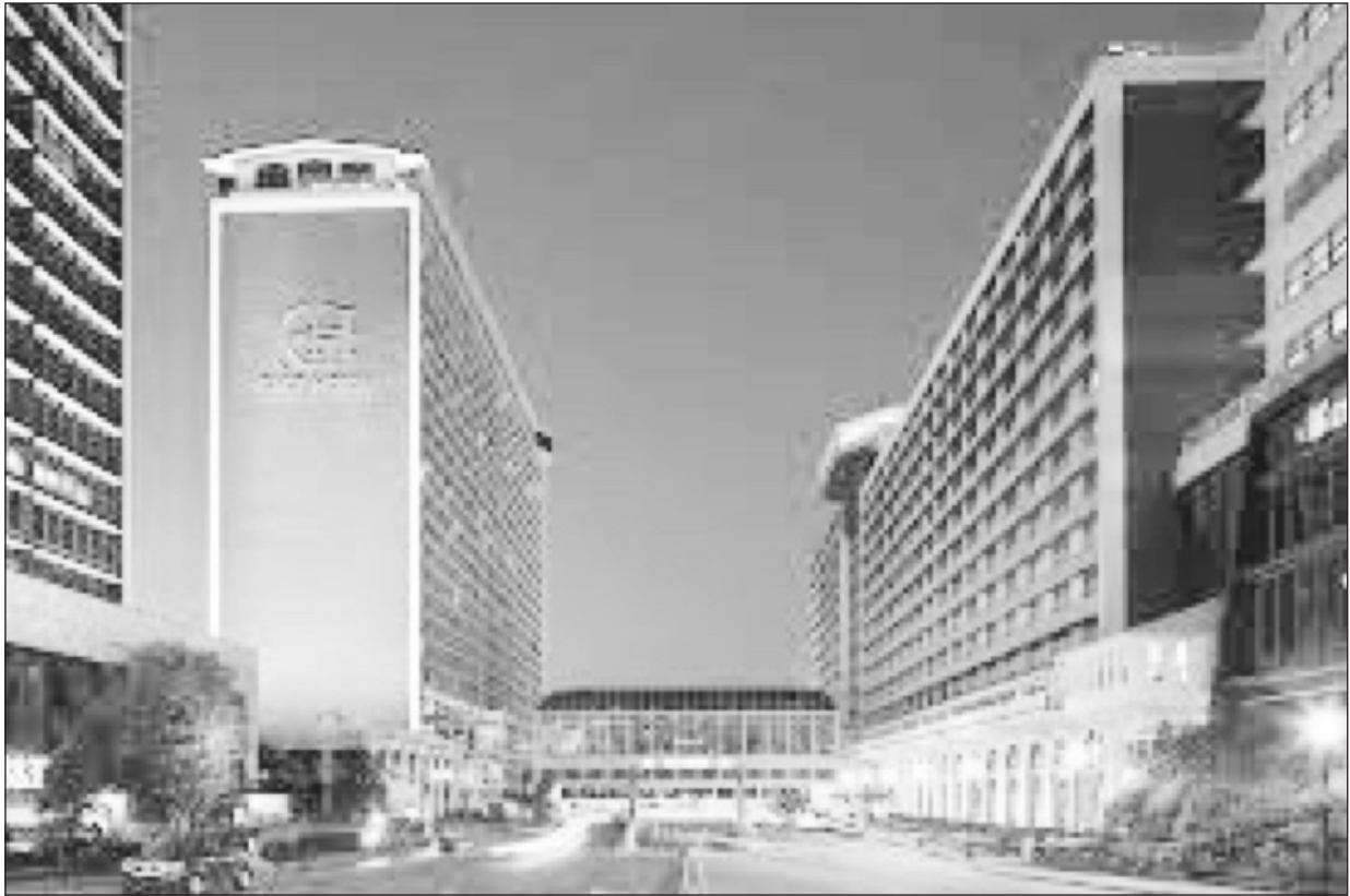
Galt House Hotel