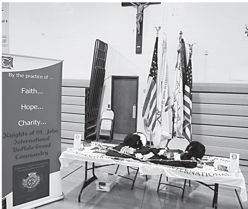
The Grand set up a display table at the Catholic Men's Conference to showcase information about the order.