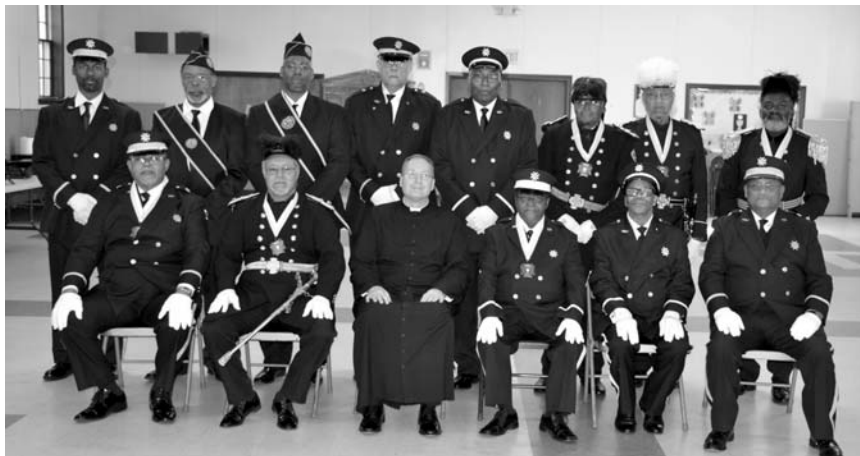
Maryland Regiment Knights participated in Annual Muster and Inspection.