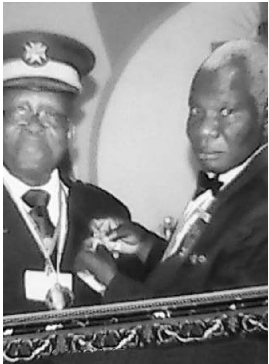
Brig. Gen. Ihionu decorates Brig. Gen. Eukeme.