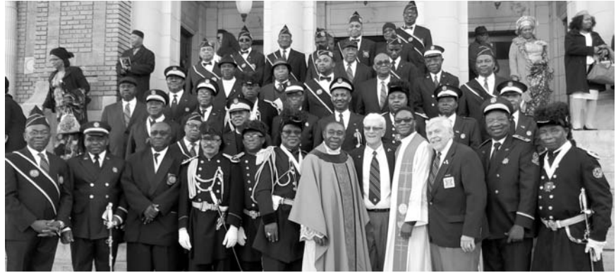
2 nd & 3 rd Degree Group Photo of District 4 Members with the Supreme Secretary and NY Grand President after the exemplification.