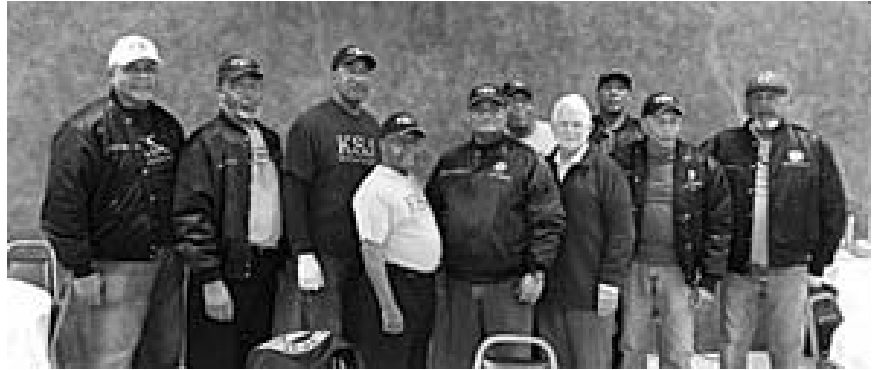
Commandery #309 Knights at Safe Nights.

Safe Nights-Nine members of Commandery #309 assembled at 4:30 in the morning on Sunday,