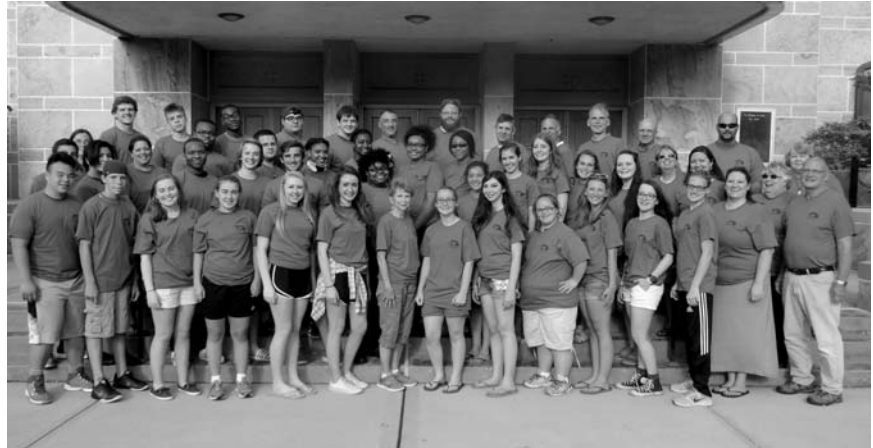
The Appalachia Project, youth and adult volunteers, led by several members of Commandery #98, before traveling to Southern Ohio for their summer work program.

mandery #98 are also gearing up again for the annual Appalachia Project. They will also attend their fund raising event on March 4, with donations from the Knights. This program, celebrating 25 years of success, consists of approximately 50 high school and college age youth from Christ the King and St. Catharine parishes and from several high schools in the Columbus area. During the last week of June, these youth, along with an experienced adult staff, will travel to