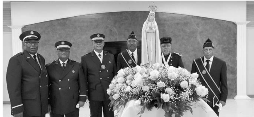
The Maryland Regiment Knights participated in the Procession of the Blessed Mother through Laplata, Maryland.

On August 15, 2017, the Knights of Saint John Commandery #287 of Atlantic City, NJ, joined with The Knights of Columbus to lead the Procession for the Mass at Boardwalk Hall in Atlantic City. The