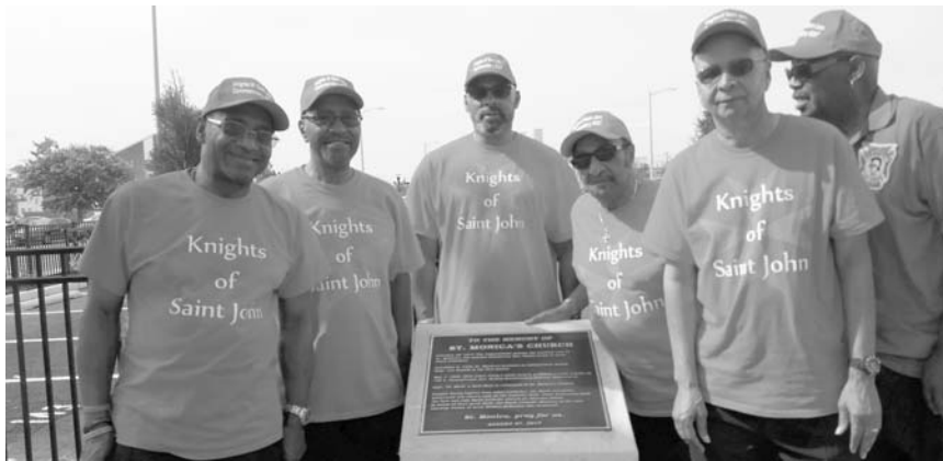
Members from Commandery #287 at the newly dedicated plaque.