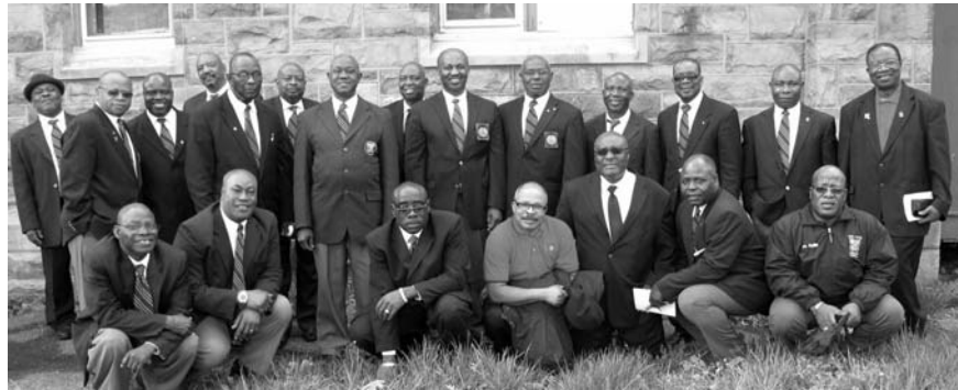
District 4 Delegates after the meeting.