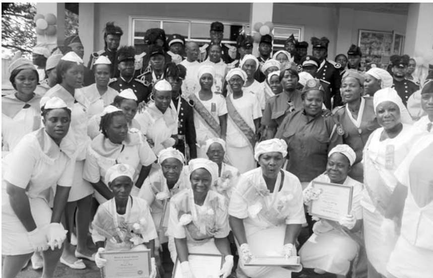
Group photo of some sisters and brothers after the program.