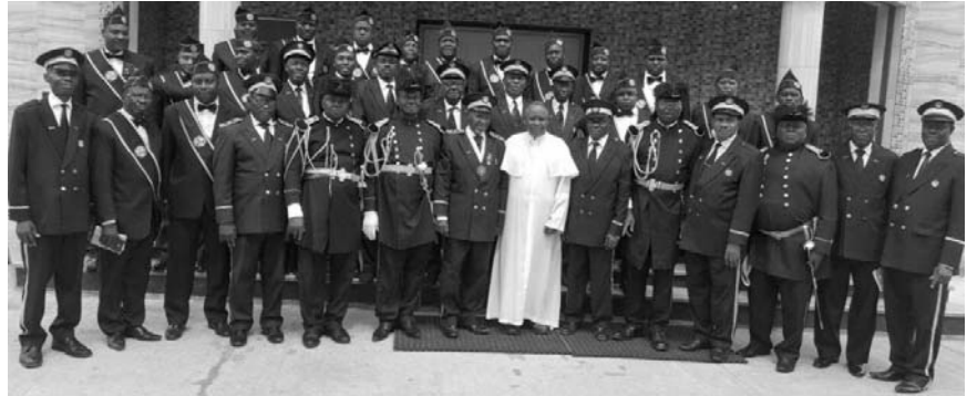
The Grand President, Grand Spiritual Director and Grand Board of Trustees with the members of the newly inaugurated Commandery #882 Nneni.

The Grand also recorded a great increase in the number of those initiated on the 5 th of November, 2016. A total number of 49 aspir-