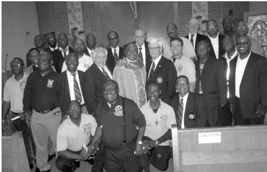
Brothers of the New York Grand in the Villa of Our Lady Retreat House.