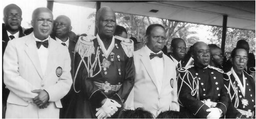
Grand Officers at Church Service