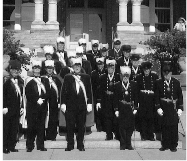
The Honor Guard at Mass consisted of Knights of St. John Commandery 313 and members of the K of C.