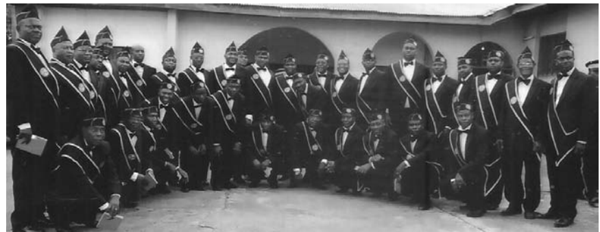
Members with grand president (centre) at 2nd and 3rd degree ceremonies.