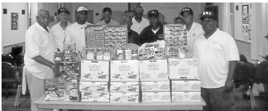
Commandery #283 Food Drive.