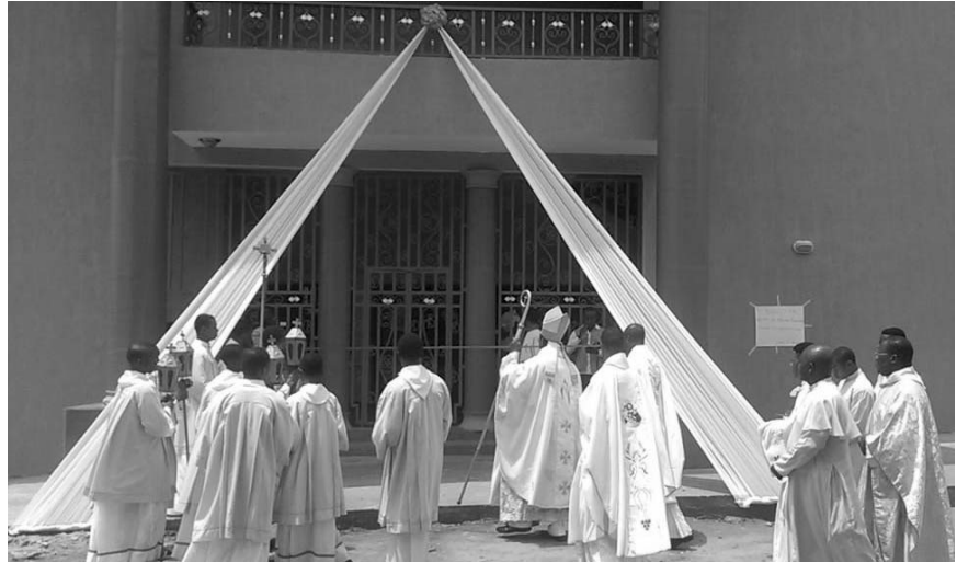
Blessing of Commandery #545 Hall.