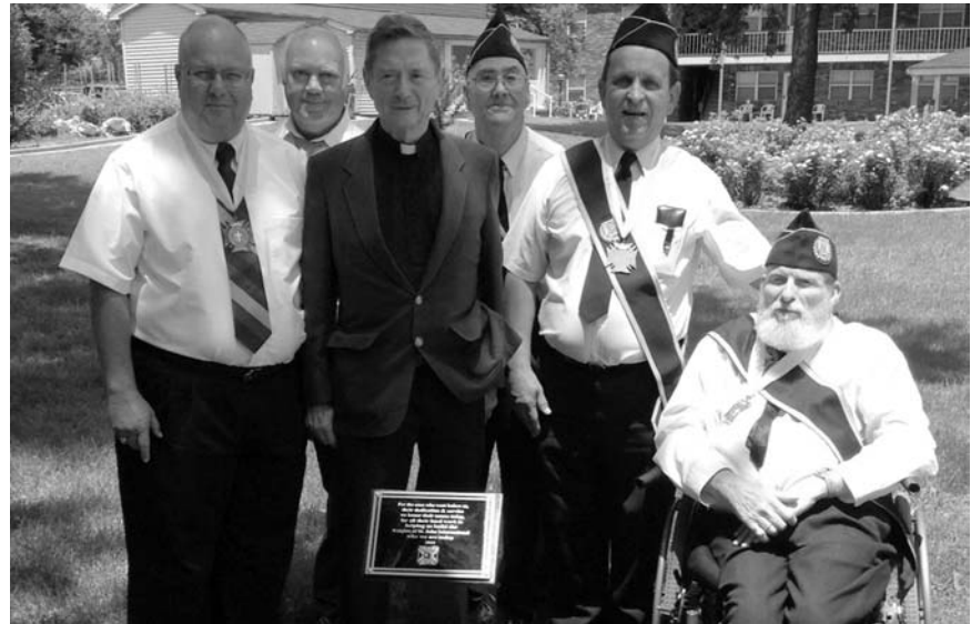
Enlargement of plaque in foreground.