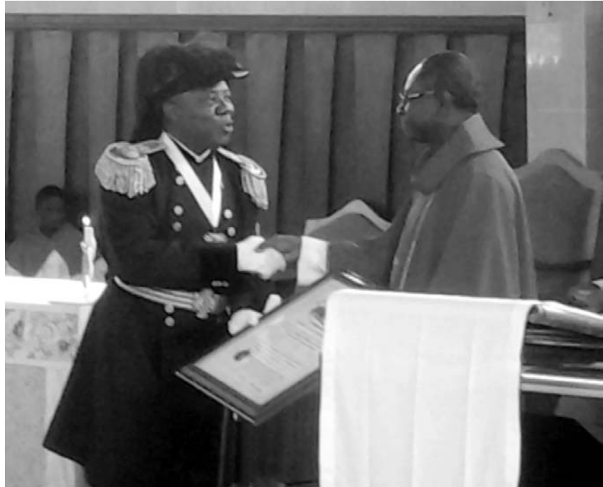
Presentation of Charter by the Grand President.

He encouraged us to let love be our guide in everything we do and also urged Brothers and Sisters to avoid discrimination and disrespect for one another.