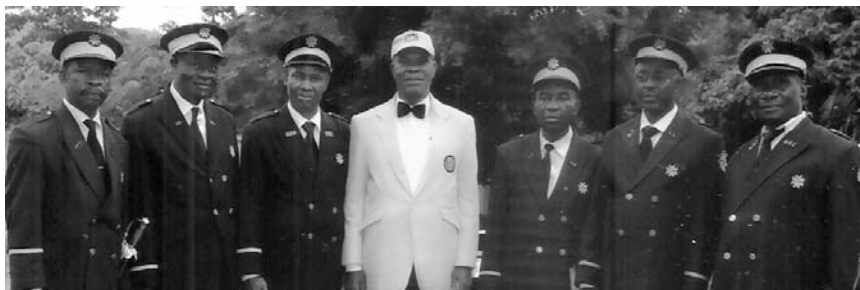
Some new brothers initiated into the Enugu Grand Commandery.

The aspirants were presented by 17 local commanderies and activities started from the 9 th of July 2015. The activities started with an address by the grand president, talks, confessions, Holy Masses, drills and Stations of the Cross. On 10 th July, all the aspirants went through a grand screening. On 11 th July a grand board meeting was held and the aspirants became brothers after their initiation. A Holy Mass held on Sunday 12 th July, was attended by some of new brothers' friends and well wishers. Enugu Grand Board of Trustees (GBOT) very warmly welcomes the new brothers into the order.