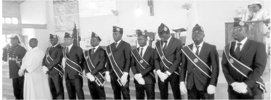
Officers of St. Patrick Commandery being introduced to parishners.