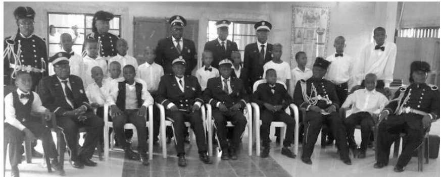
The Grand President and his team with St. Anthony's Cadet Commandery #545 Enugwu-Ukwu.

brated the decrease in its membership, it also increased its membership through First Degree Initiation of 19 members while 25 members were invested. The monthly visit of the Grand Presi-