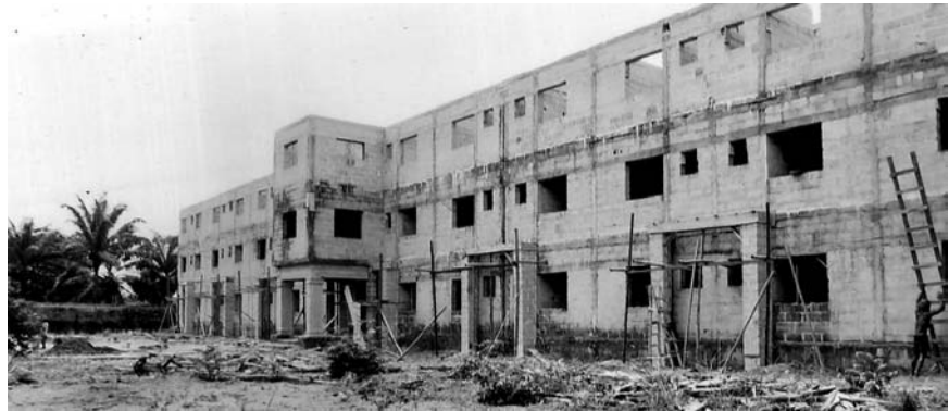
Owerri Grand Hostel, Gearing for Completion.