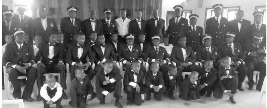
The Grand President and his team with St. Thomas Aquinas Cadet Commandery #712 GRA Awka