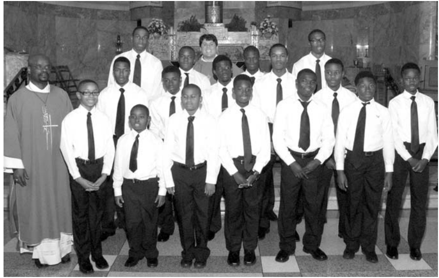
Cadets of Commandery 676 with their Spiritual Director.

Congratulations to Knights of Commandery 680 and Ladies Auxiliary 592 on their tireless efforts to support the Blessed Sacrament Church of the Archdiocese of Newark. The congregation applauded them in