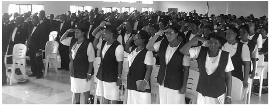
Delegate at Awka Gaand Convention Saluting our departed members at a memorial Mass.

A cursory look into the history of Awka Grand Commandery shows that the beginning of what is today known