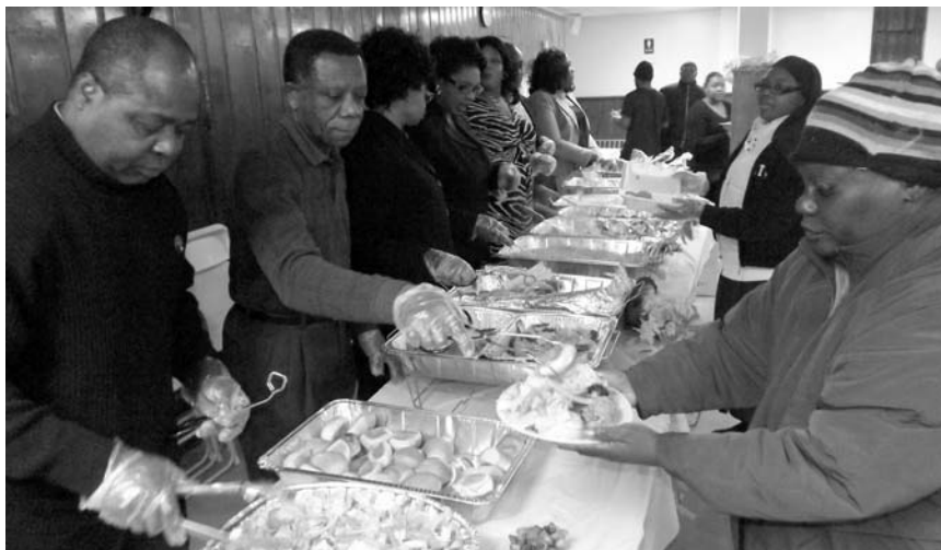
Knights and Ladies of 680 serving the homeless.