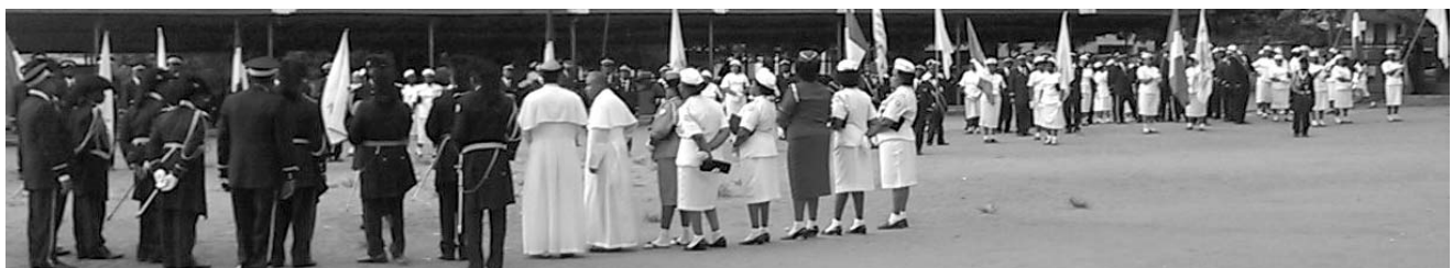
A cross section of Supreme Subordinate President and others inspecting parade during Awka Grand Maiden Convention.