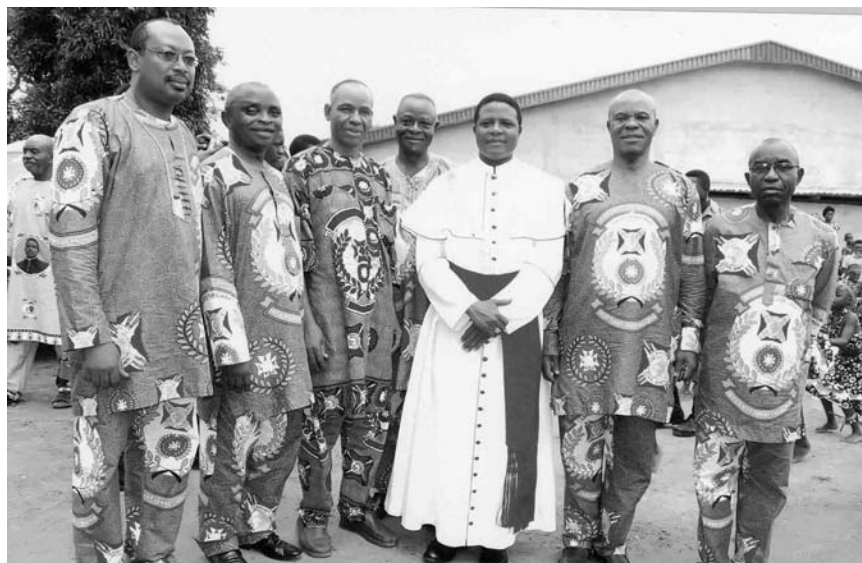
The New Catholic Bishop of Nsukka with Enugu Grand President and team during a visit on August 4, 2013.