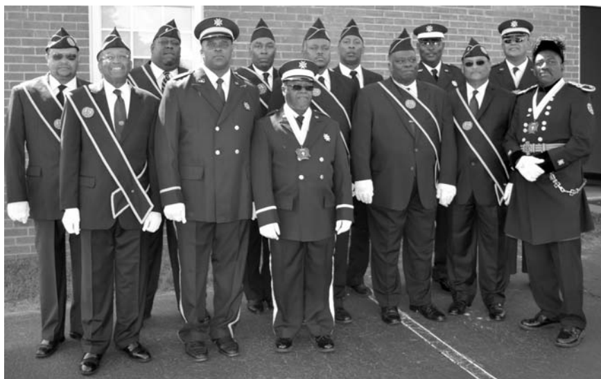
Knights Assembled at St. Joseph Parish 250th Anniversary.

St. Joseph Parish located in Pomfret, Maryland celebrated its 250 th Anniversary, Mass and picnic on September 22, 2013. The special outdoor Mass was celebrated on a sunny afternoon under a large white tent. His Eminence Donald Cardinal Wuerl, Archbishop of Washington was the principal Celebrant and Homilist for the Mass. There were a large gathering of Concelebrating Priests, Deacons, Nuns, Altar Servers, and a combined Choir providing the music. Elected officials representing the State of Maryland and Charles County were in attendance. Piscataway Indians helped welcome those who were attending Mass by chanting and playing a large drum. Color Guards for the Mass were performed by the Knights of St. John and the Knights