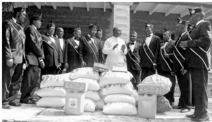
Charity presentation by St James Commandery 706, Aku, to the Parish Priest on the occasion of celebration of feast of St John the Baptist.