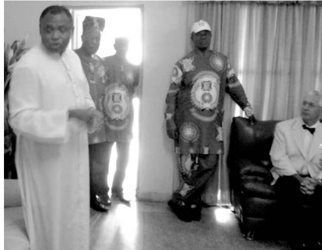
Reception of Supreme entourage at Enugu Bishop's place.