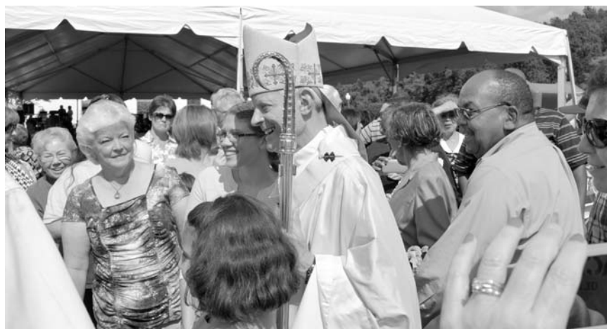
Cardinal Donald Wuerl greeting people after Mass.