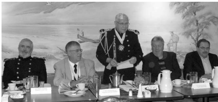
Commandery #204 Centennial Mass and Breakfast.

Think about this and then also relate it to our relationship with our Lord. He is ALWAYS there for us. Ever consistent, always reliable, no matter what day, or whatever season it may be. This is such a wonderful thing that we almost always struggle with realizing and contemplating. If we could only realize the newness of our Lord never fades no matter what season of change is