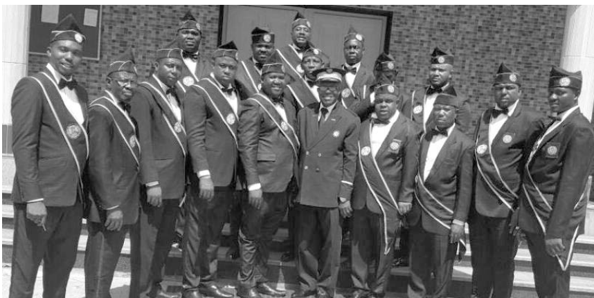
Members of the new Commandery #892 Neni after their Thanksgiving Mass.