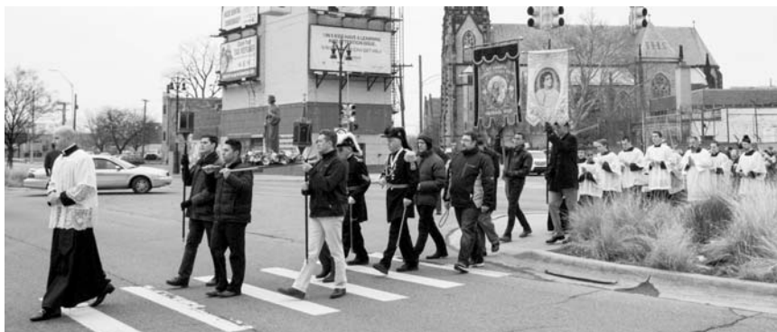
Procession, St. Joseph Day of Prayer.