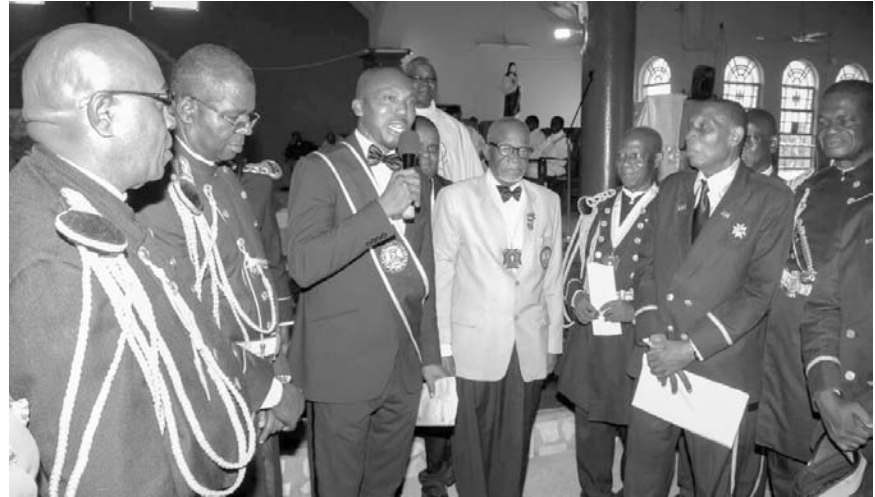
The Charter Worthy President of Commandery #892 Neni appreciating Awka Grand President at the thanksgiving Mass in honour of their successful inauguration and installation of officers.

On the hills of this retreat, came the Chrism Mass/ Cathedraticum which was celebrated on Thursday, 13 th April. That day, the Bishop of the Diocese concelebrated Mass with all the Diocesan Priests in which each renewed his Priestly Ordination vows. In the same Mass, members of the Laity displayed their love and solidarity with their Diocesan Bishop through presentation of gifts in cash and kind to him to aid him for his pastoral work in the Diocese. Awka Grand Commandery turned out Commanderies and LAUX to join adherents for the celebration. Awka