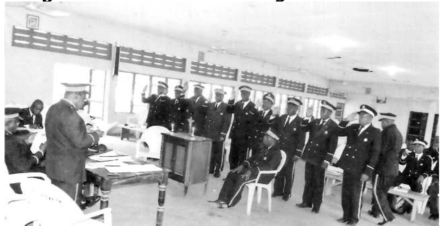
Installation of newly elected officers.