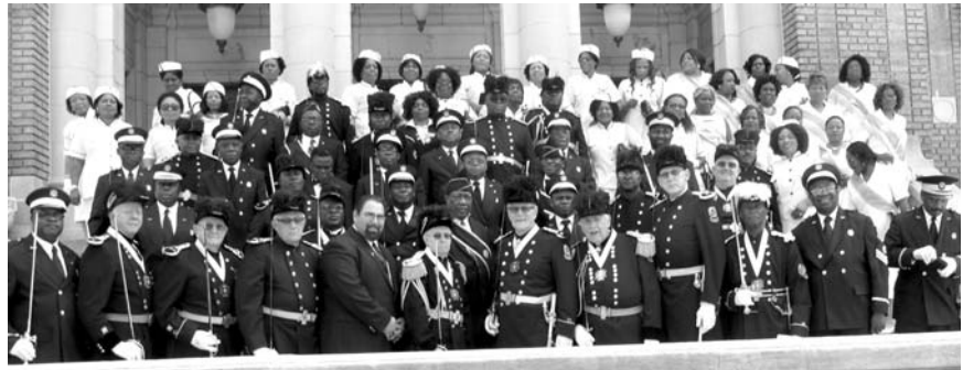
Knights and Ladies of the New York Grand after the Eucharistic Mass.