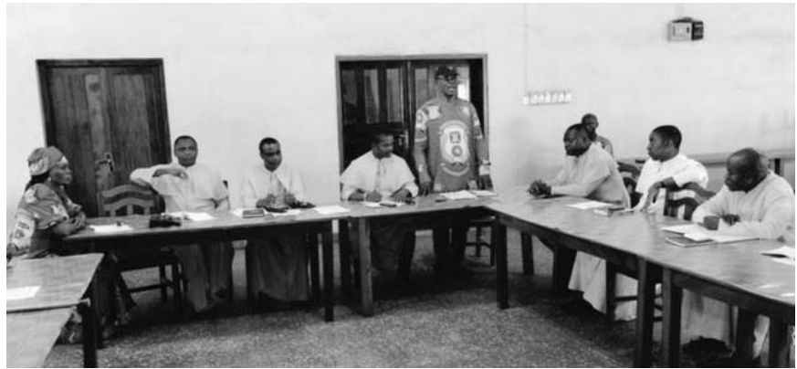
The Enugu Grand President addressing spiritual advisers.