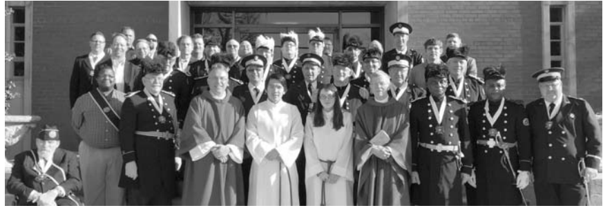
Attendees of the Joint Cincinnati/Kentucky Grand Convention.

The 2015 Commandery #59 Golf outing is Sunday, August 2 nd at Avon Fields Golf Course in Cincinnati, Ohio. We are having a shotgun start this year at 8 am. We would like to have at least 20 teams. We have been close for the last few years at 18. This year's tournament again is open to all knights, relatives and friends. The