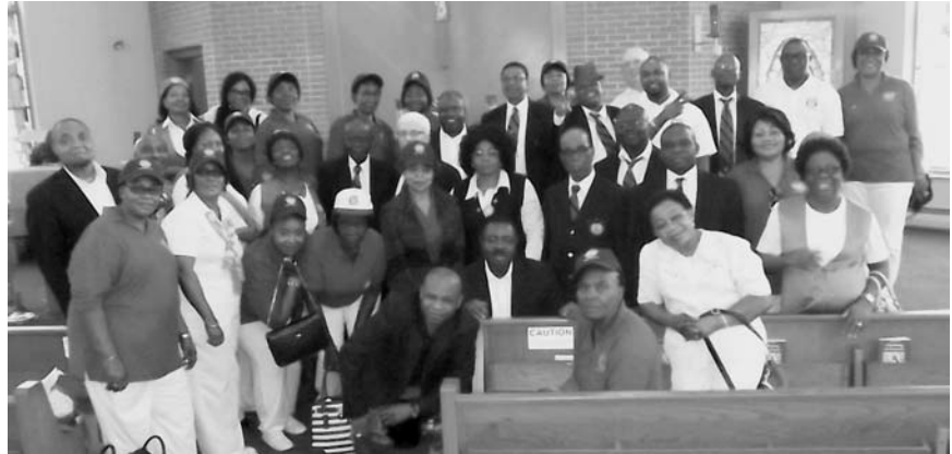
Brothers and Sisters of the New York Grand in the Villa of our Lady Retreat House.

The annual pilgrimage of the New York Grand Commandery was held at the Sacred Villa of Our Lady Retreat House, Mount Pocono, PA on Saturday, September 10 th , 2016. The retreat commenced with a Eu-