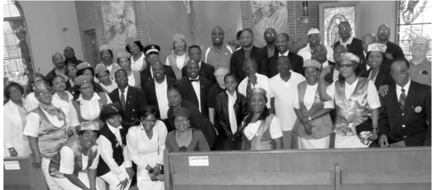
Members of New York Grand Commandery and Ladies Auxiliaries in the Villa of Our Lady Retreat House.